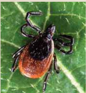
* Ixodes scapularis , female

The blacklegged tick, also known as the 'deer tick', can transmit the bacteria that cause anaplasmosis and Lyme disease and the parasites that cause babesiosis. The risk of exposure to this tick is greater in wooded or brushy areas and in the edge area between lawns and woods.