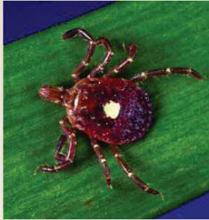
* Amblyomma americanum , female

The lone star tick can transmit the bacteria that cause ehrlichiosis. It may also transmit other diseases as well. This tick is most common in Southern Ohio where it is found in shady areas along roads, in meadows and woods.