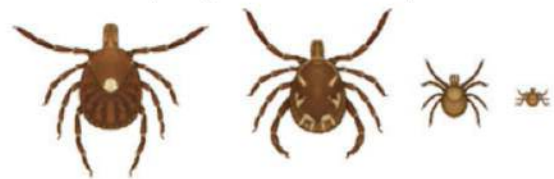
Dog Tick ( Dermacentor variabilis )