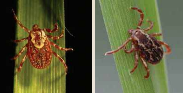
* Dermacentor variabilis female (left) and male (right)

The American dog tick can transmit the bacteria that cause Rocky Mountain spotted fever in humans and dogs. It is the most commonly encountered tick in Ohio and is often found in overgrown lots and along weedy roadsides, paths and hiking trails.